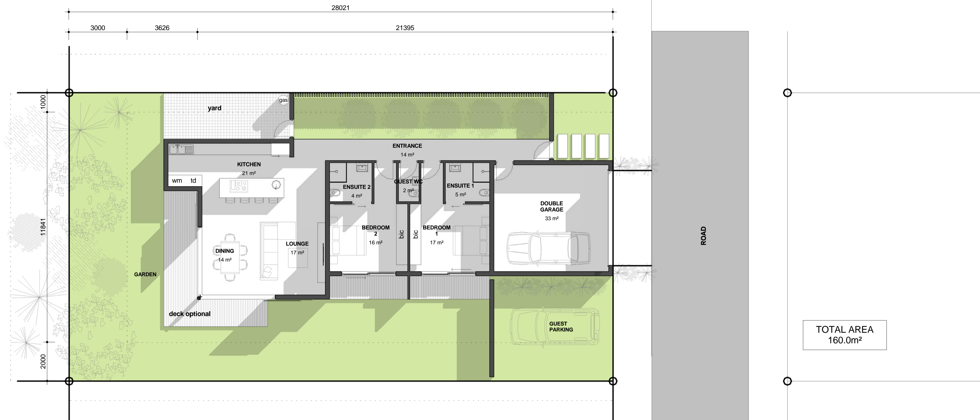
GROUND FLOOR SCALE 1 : 100